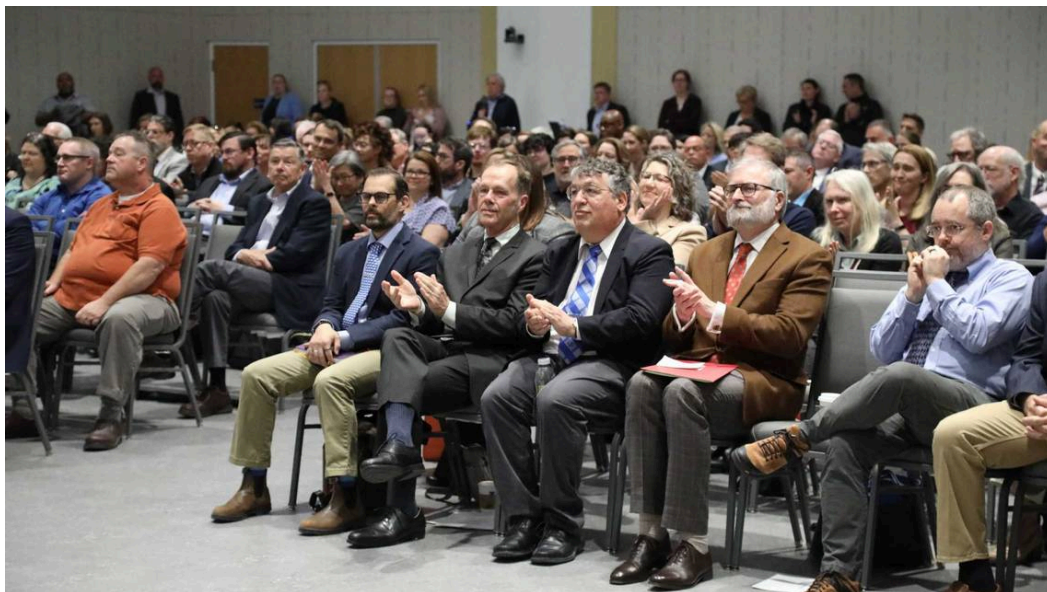
University of Kentucky faculty and staff attend the board of trustees meeting on April 26, 2024. The board heard from nine people opposed to a proposed change to the university's governance structure, which would move the university senate to an advisory role.